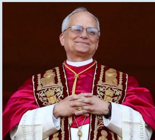
Habemus Papam! We have a Pope!